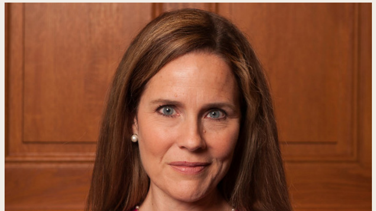
Justice Amy Coney Barrett

But what excites us the most is that she has a demonstrated record as a constitutional jurist. She interprets the text but only the text. She recognizes it isn't her job to invent laws from the bench. It is her job to simply interpret the laws our elected representatives have written.